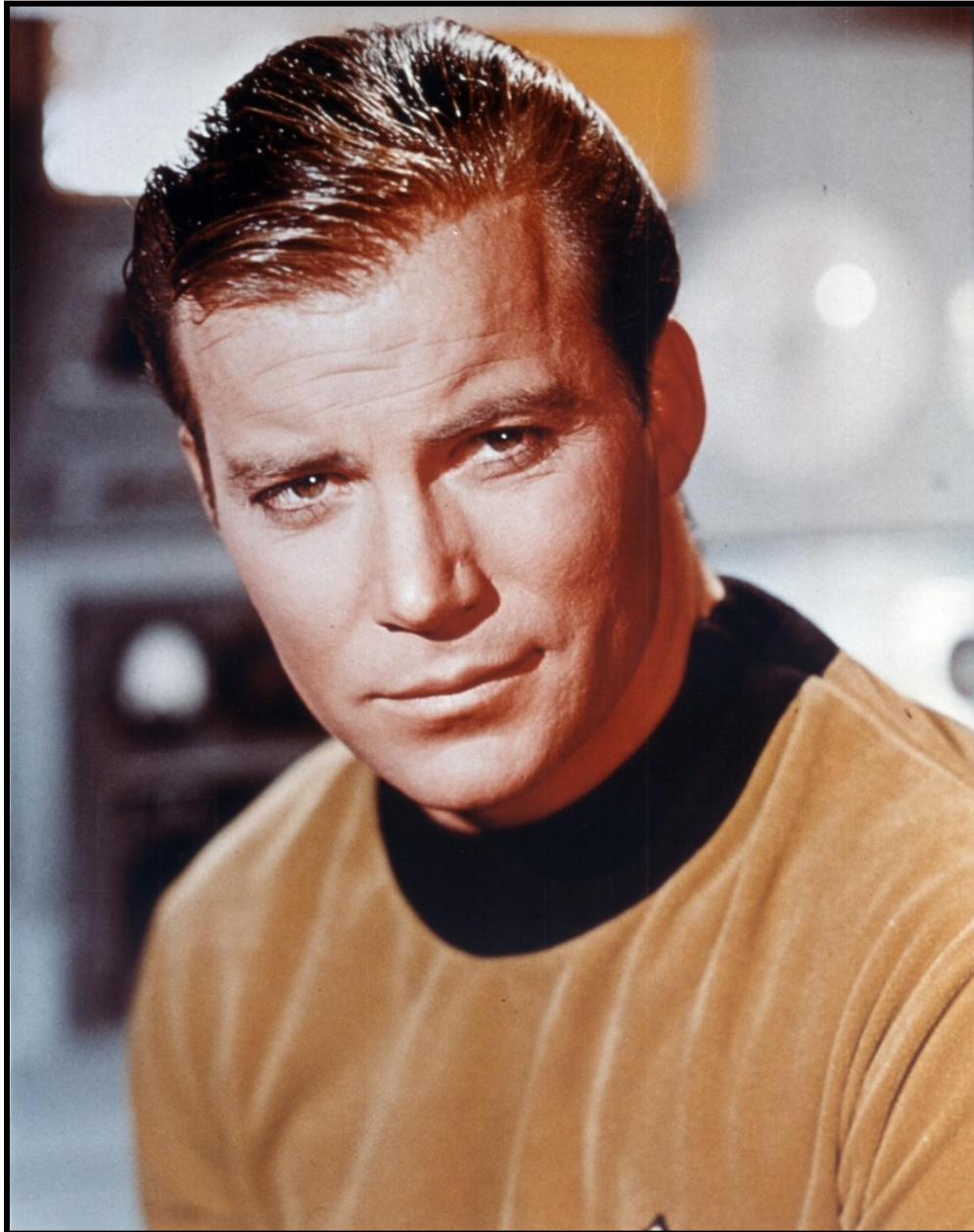
William Shatner as Captain James T. Kirk, 1966.